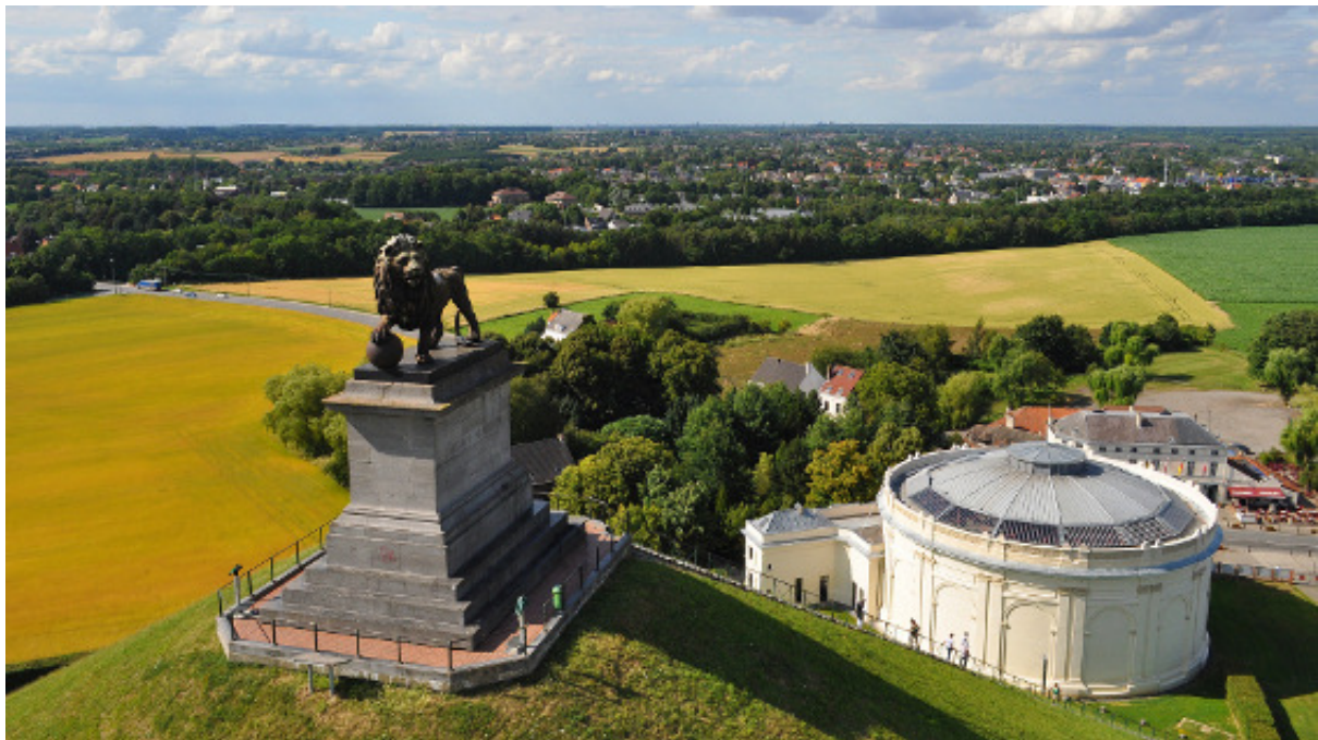
Lion de Waterloo - Panorama

Then become a Wallonia.be brand ambassador !